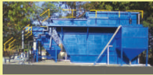
Paint booth effluent treatment plant