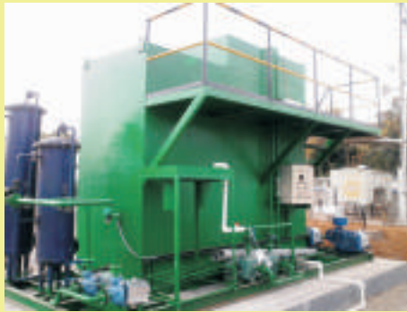
Packaged Sewage treatment plant